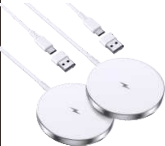
Magnetic Wireless Charger for iPhone 15/14/13/12