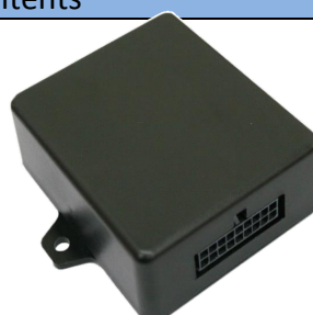
4" UNI-CAM Module NTV-ASY166