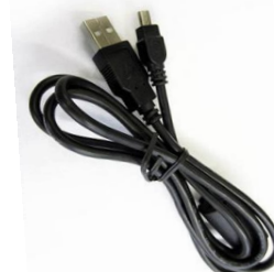
USB Cable NTV-CAB009