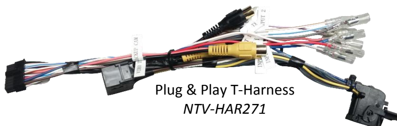
Plug & Play T-Harness NTV-HAR271