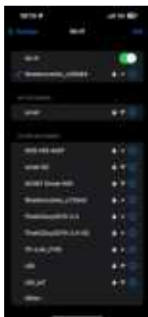
Open iPhone/Android Settings & Connect to Wi-Fi