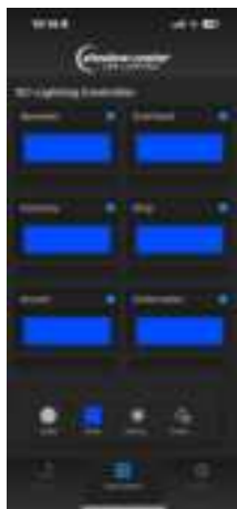
Select a Zone and Control the Color