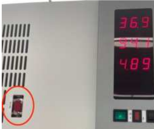
Figure 1 Service data port on Liconic Storex Incubator