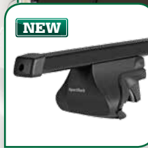
SR1098-SR1099 For vehicles with factory raised rails