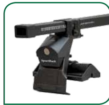
SR1002, SR1003, SR1004, SR1005, SR1008, SR1010 For vehicles without factory rack or rain gutters