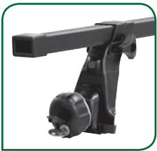
SR1001 For vehicles with rain gutters