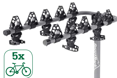
SR2405 2" receiver only