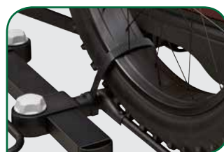
Fat Bike Accessory Strap #SR0029