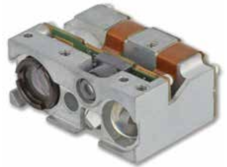
Extended FlexRange EX30 2D Scan Engine

The Extended FlexRange EX30 may easily be embedded into mobile devices running under an OS by using the resources of the device's main processor. Honeywell supports its customers with integrating decoder software into their solutions, saving the cost of ownership by eliminating hardware and also enhancing performance by using the main processor's power.