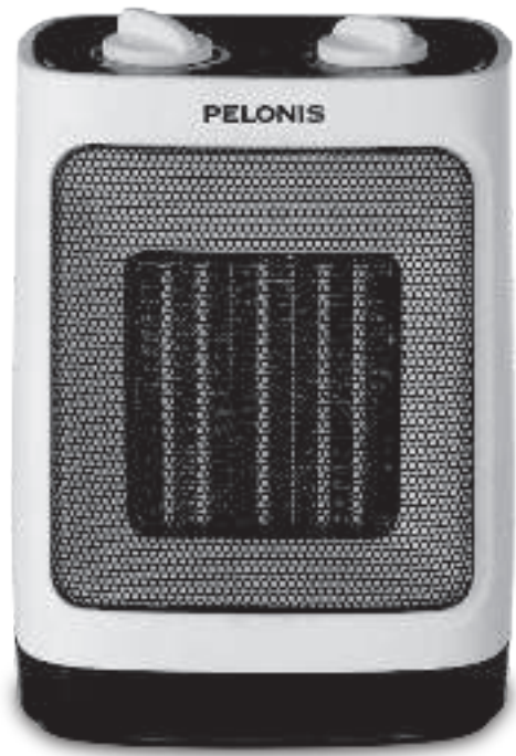
PORTABLE OSC CERAMIC HEATER MODEL: NTY15-16LA