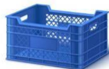
Logistic Basket Tracking

* Note: the scenarios mentioned above is only for references.