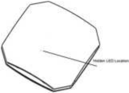
Figure 2: AP511 Front View

The AP511 access point is equipped with hidden LED display that indicates different status with different color. For the details of the LED status, please refer to the Quick Start Guide.