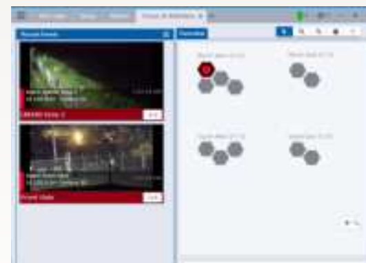
Avigilon Unity Video integrated with Senstar perimeter intrusion detection sensors