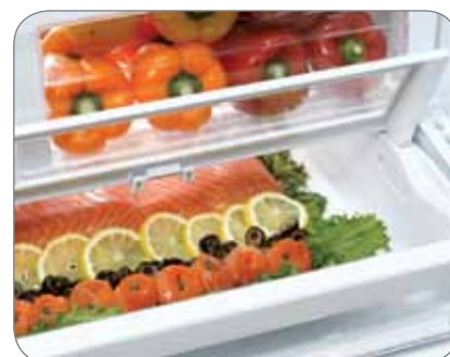
CoolSelect Pantry™ with Temperature Control