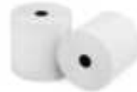
Setup paper roll