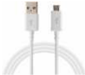
Adapter + cable USB-C / USB