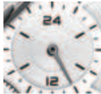
12/24 Hours Display