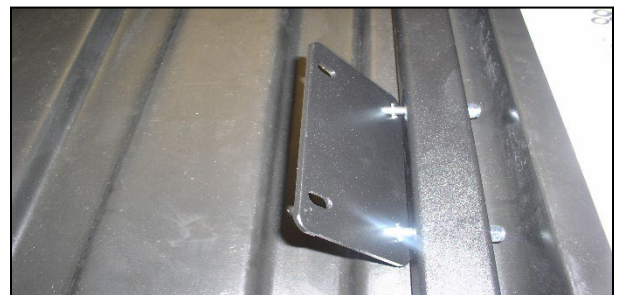
FIG. 4A (OUTSIDE MOUNT)