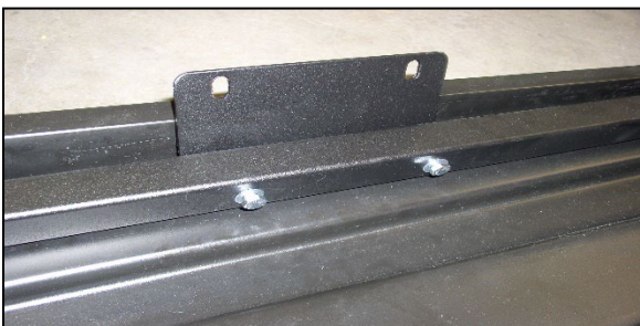
FIG. 4 (INSIDE MOUNT)

**NOTE**MOUNTING PLATES CAN BE MOUNTED TO THE INSIDE SEE FIG. 4 OR OUTSIDE SEE FIG. 4A OF THE CANOPY FRAME TO ACCOMMODATE YOUR ROLLBAR WIDTH. **