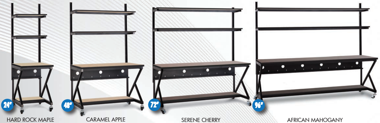
HARD ROCK MAPLE