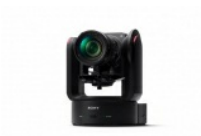
ILME-FR7 Cinema Line Full-frame PTZ Interchangeable