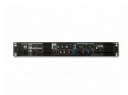
HXCU-FZ90 4K / HD Camera Control Unit for HXC-FZ90 cameras