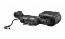
HDVF-EL30 OLED 0.7-inch colour Full HD viewfinder with 3.5-inch sub-LCD