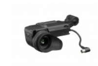
HDVF-EL20 OLED 0.7-inch colour HD viewfinder