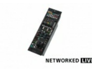
RCP-3500 Remote-control panel for HDC/HSC/HXC