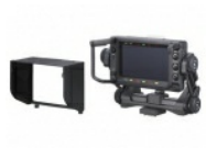
HDVF-EL75 7.4-inch OLED Viewfinder for portable cameras