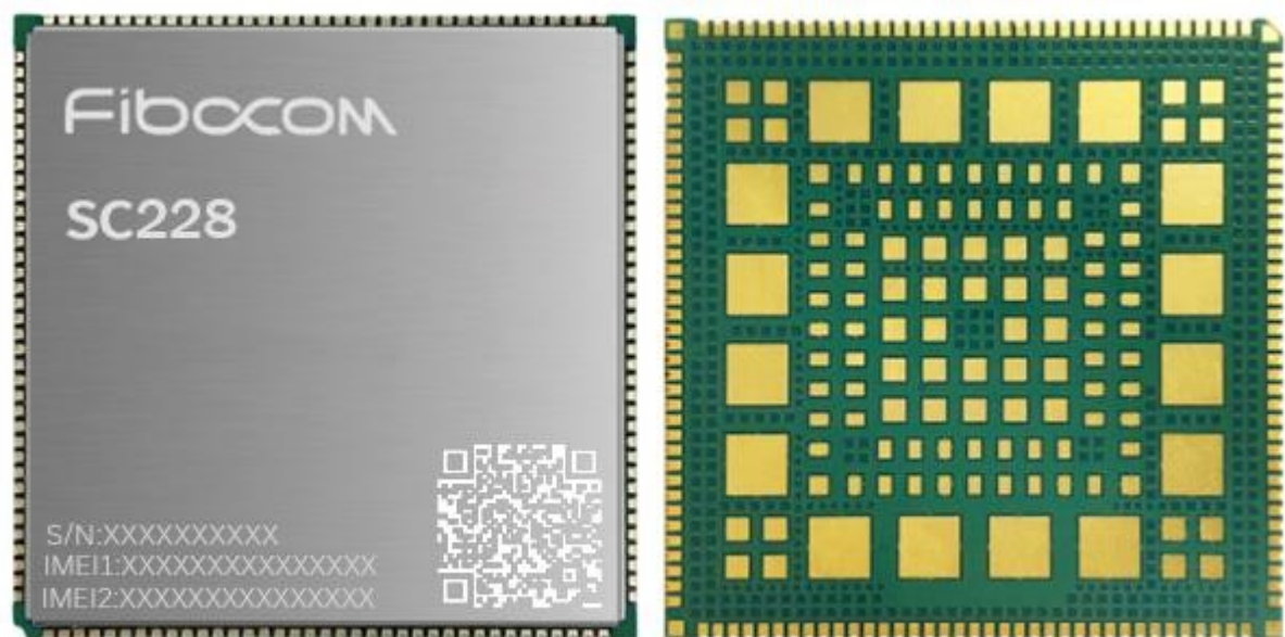
Figure 30. Product appearance