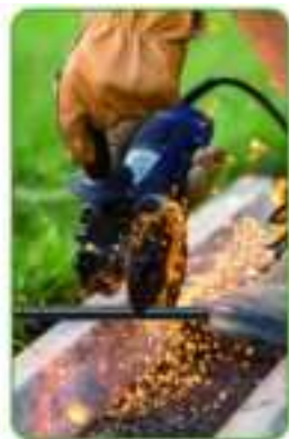
Simple DIY Forge