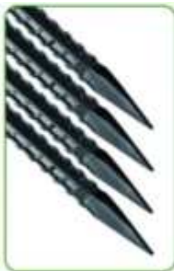
Chisel Point End, Easy to Dig