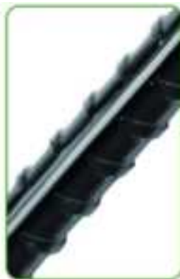
Black Steel, Rust-proof