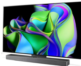
Mode 1: Table Top