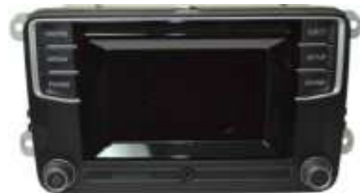
2017 Beetle Radio