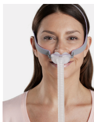
Nasal Pillow Mask