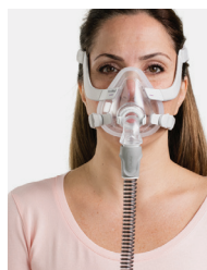
Full Face Mask