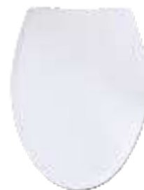
Toilet Seat & Lid