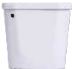
Pre-assembled Toilet Tank