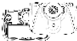
REMOVE UNIT COVER