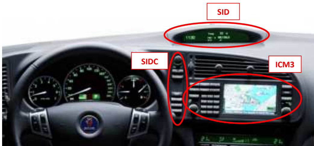
Components related to the SID

The figure below shows how the ICM and SID looks like (vehicle in figure equipped with ICM3):