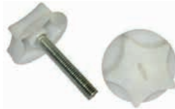
4x Bed Bolts