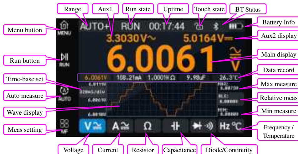
图 2.2.1 万用表测量界面

The multimeter interface displays rich content: top status bar; left 4 multi-function touch buttons; middle for various measurement displays; bottom 6 touch buttons to switch 8 measurement functions; as shown in Figure 2.2.1.