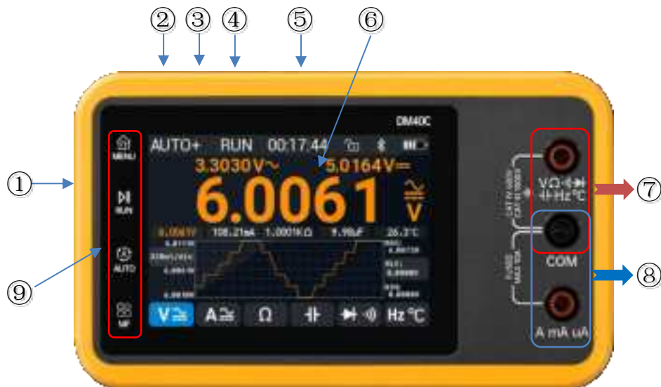
图 2.1.1 DM40 外观和接口