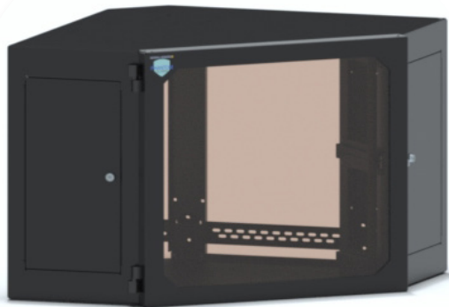
12U CORNER WALL MOUNT CABINET Item #:1915-3-700-12

Rethinking your room's workflow possibilities with one visionary design.