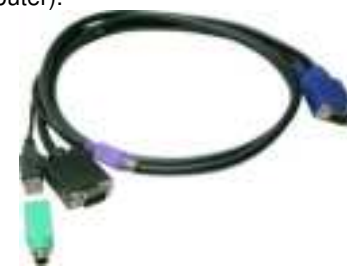
Special integrated USB & PS/2 KVM cable

Step 5. (Now your KVM switch or daisy-chained KVM Switches should have been powered-up and initialized....) Connect each of your computers to a computer port on the rear of the switch (es). You should use the special USB PS/2 KVM cable (with the USB-to-PS/2 adapter) for connection to a USB computer (PS/2 computer).