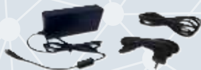
1x 12V6A (72W) Power Supply