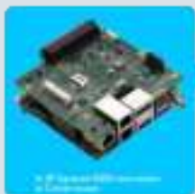
1x UP Squared 6000 system