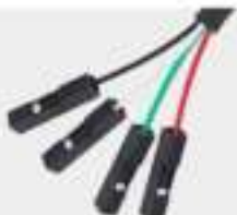
4Pin Female Socket