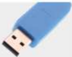
USB 2.0 Male Plug