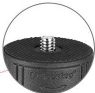
Standard 1/4" Screw (For cellphones and cameras)