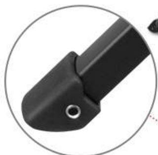
Non-slip Rubber Feet