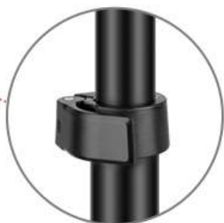
Quick Flip Locks (Height adjustable)