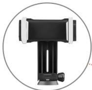
Phone Holder (Extends from 2.3"-4.5")