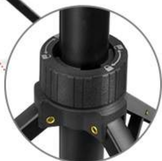
Base Locking Knob