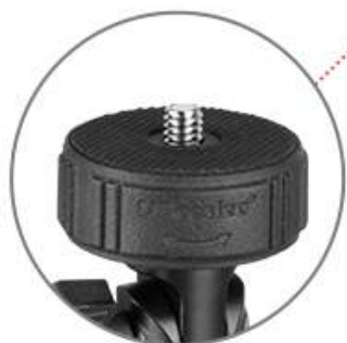
Free Rotation Plate (360°Pan & 180°Tilt)