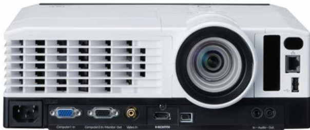
3351 (Desk Edge) Fan & connectors are up-front Optional, snap-in, internal, IWB kit