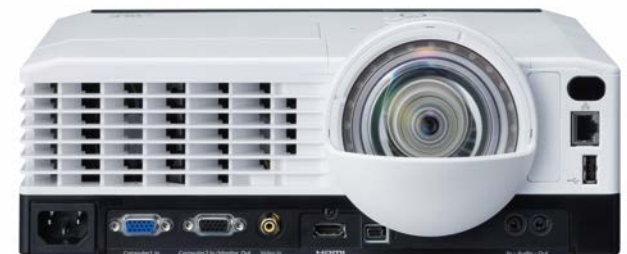
4241 (Short Throw) Large screen even 2 feet away. Optional, snap-in, internal, IWB kit