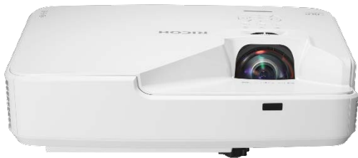
4540 Laser – 20k hours – Short Throw