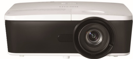
PJ WU5570 5500 lumens