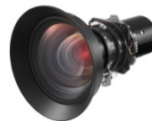
Lenses sold Separately.