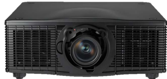
KU12000 Dual lamp - 12,000 lumens