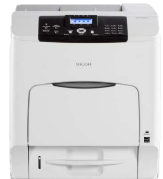
C435 / C440