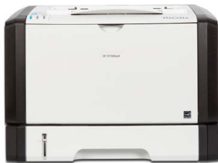
325 / 377