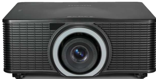
6280 Laser – 20k hours