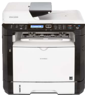
325 / 377