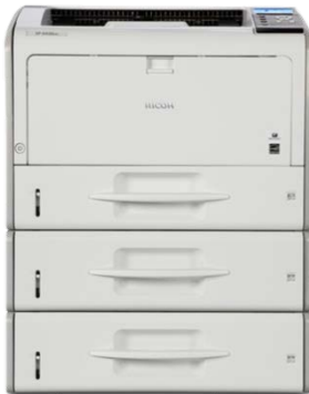
SP 6430DN with 2 optional paper trays