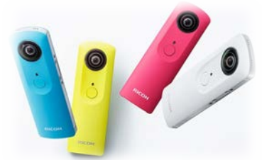
360° still & video camera