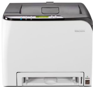
C250 / C252