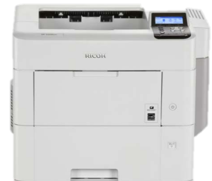
5300 / 5310