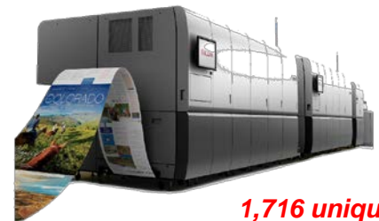
1,716 unique color prints / minute!