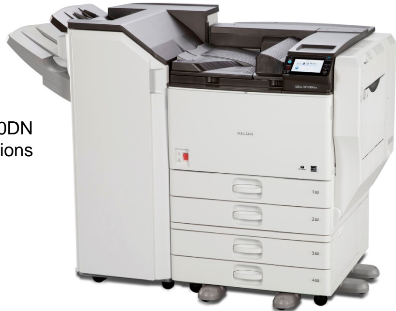
SP 8300DN with options