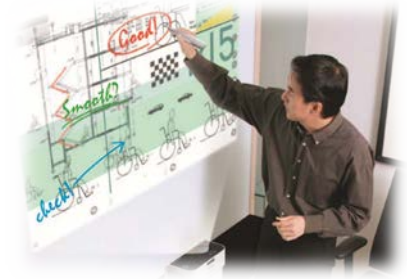
Wireless ultra-short throw projector / whiteboard