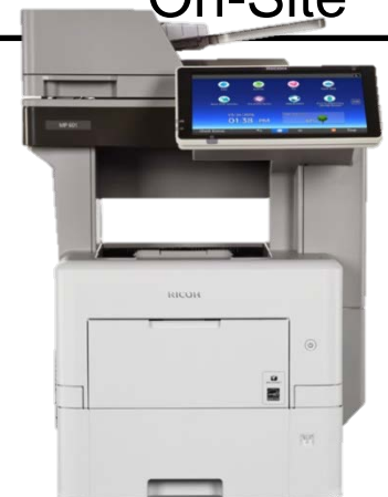
501 / 601