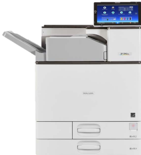
C840 / C842 base model