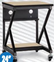
24" HARD ROCK MAPLE