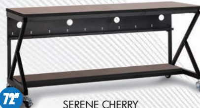
72" SERENE CHERRY