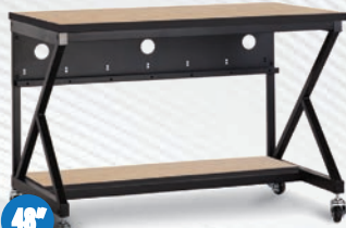
48" CAMEL APPLE