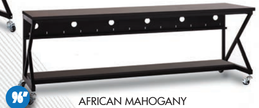
96" AFRICAN MAHOGANY