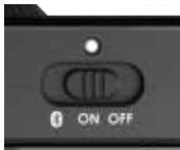
FIRMWARE UPDATE INITIATED (SOLID) IN PROCESS (FLASHING)

When a firmware update is complete, the POWER SWITCH LED will illuminate solid green to indicate a successful update; the LED will illuminate solid red to indicate a failed update. Mustang Micro is automatically powered up during the firmware update process; when an update is completed successfully, disconnect the USB cable from Mustang Micro and restart the unit.