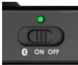
FIRMWARE UPDATE SUCCESSFUL (SOLID)