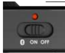
FIRMWARE UPDATE FAILED (SOLID)