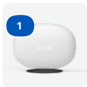
AT&T All-Fi™ Hub