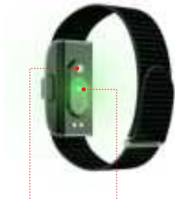
Skin Temperature Sensor