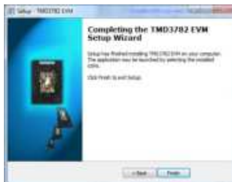
Installation Completely Successfully