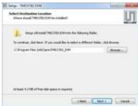
Select Installation Folder