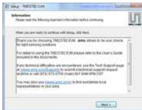
Thank you Screen