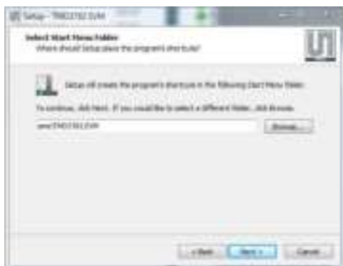
Select Start Menu Folder