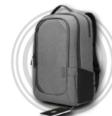
Lenovo 17" Laptop Casual Backpack B730