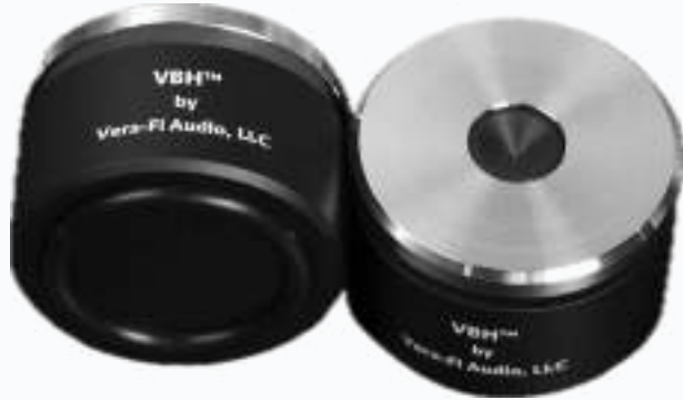
4x VBH Base

Before assembly, ensure that all the following items have been included with your Vibration Black Hole (VBH) - M6 Thread Spikes. If anything is missing, please contact us at sales@verafiaudiollc.com