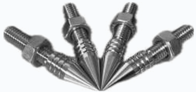
4x Spike Feet