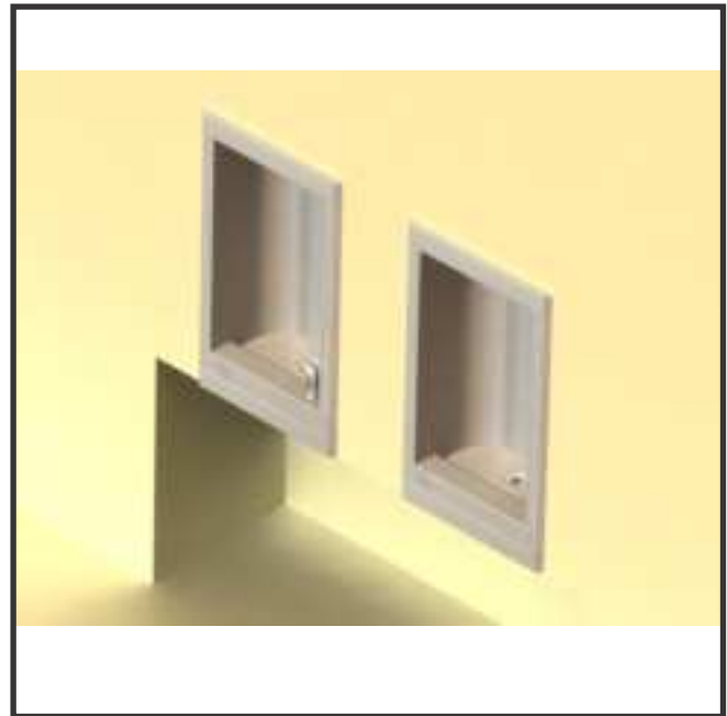
“INDOOR USE ONLY”

Model A181400S-CUSP is a fully recessed, wall mounted drinking fountain and cuspidor made from 18 gage, 304 stainless steel with a brushed finish. Each unit shall be activated by a surface mounted, chrome plated brass front pushbutton using less than 5 pounds of force. Bubbler shall be Stainless Steel, with an integrally designed non-squirt feature and operates on a water pressure range of 20-105 psig. Unit shall be certified to Public Law 111-380 (NO-LEAD) and NSF/ANSI/CAN 61. Fixture meets ADA, ADA Standing Person, and ADA Child requirements when mounted appropriately.