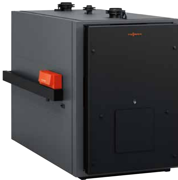
Vitomax LW (type M60A), output 700 to 1950 kW

Vitomax all-rounder – the ideal solution for supplying the heating system as a base or peak load boiler