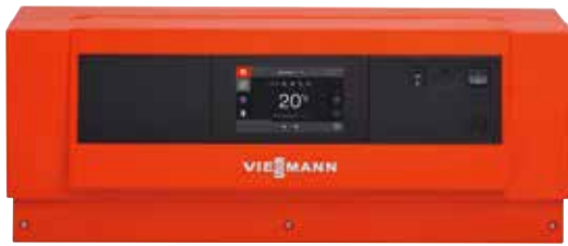
Vitotronic 200 (type CO1E) with colour touch screen for weather-compensated operation