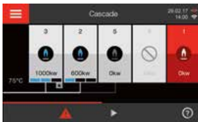
Display of the Vitotronic 300 (type CM1E). For multi-boiler systems with up to 8 boilers