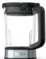
Power Pitcher with Lid