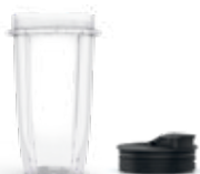
Power Nutri™ Cup with Spout Lid