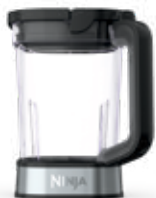
Power Pitcher with Lid