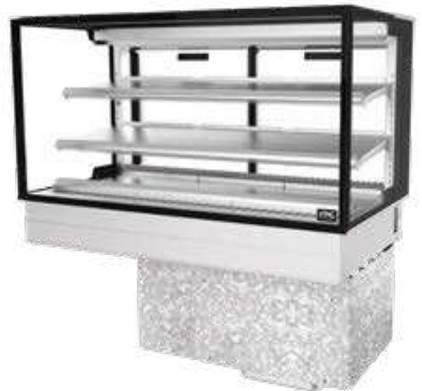
Showing : Inline 3000 Series controlled ambient 1200mm square in-counter fixed front with integral refrigeration