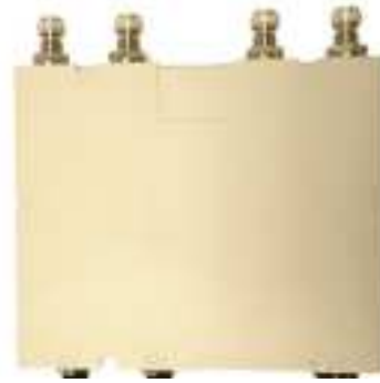
Antenna (External Type) O-RAN Compliant