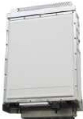
Antenna (Integrated Type) O-RAN Compliant