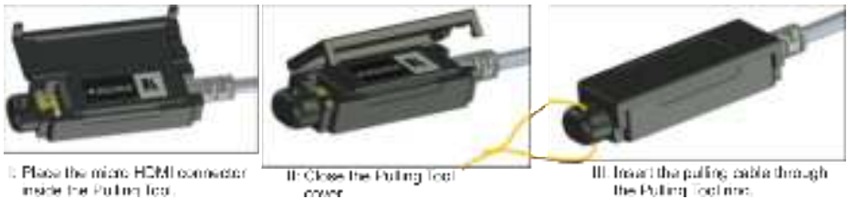
Figure 3: Attaching the Pulling Tool