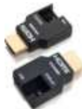
Figure 1: HDMI Connector plugs (Source and Display)

The CLS-AOCH/60-XX / CP-AOCH/60-XX provides an extremely high quality signal over a wide range of resolutions, up to 4K@60Hz (4:4:4). This cable is available in different lengths from 33ft (10m) to 328ft (100m). The CLS-AOCH/60-XX / CP-AOCH/60-XX has a slim design to let you pull the cables easily (together with the supplied pulling tool) through small-sized conduits.