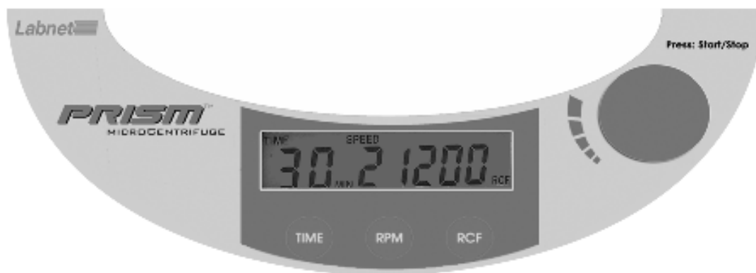
Figure 2. Labnet Prism™ microcentrifuge control panel layout.

The speed (rpm or g-force) can be selected from 500 to 15,000 rpm in 100 rpm increments or from 100 to 21,200 x g with the control knob. The speed is selected by pressing the RPM or RCF button. The speed signal will begin to blink. Then, turn the control knob to increase or decrease the value.