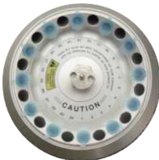
Figure 1. Loading the rotor to achieve balance.

The Labnet Prism™ microcentrifuge comes complete with a standard 24-place rotor installed. To remove the rotor for cleaning, using the rotor wrench remove the rotor securing screw from the motor shaft by turning the screw counterclockwise. Lift the rotor directly upward in a straight vertical motion.