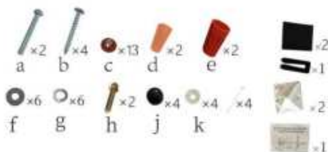
⑩ Hardware fitting