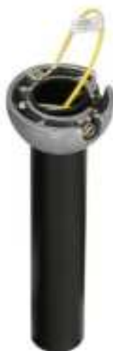
⑤ Down Rod