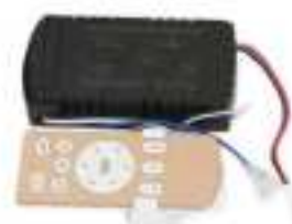
⑪ Remote Control