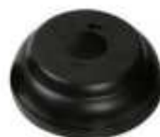
③ Up Canopy