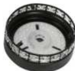
⑨ Light cover