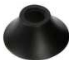
⑦ Down Canopy