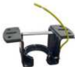
② Hanging Bracket