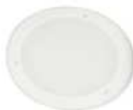
⑧ Light plate