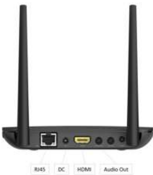
X700 Key Peripheral Ports

Installing X700 or X900 is very simple and straight-forward. The following two figures summarize the key peripheral ports available. (You may refer to the Quick Start Guide for details.)