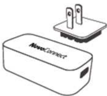
AC-DC Adaptor with Changeable Plug

The AC-DC power adaptor comes with several types of plugs, one of which should be suitable to the power outlets used in your country or region.