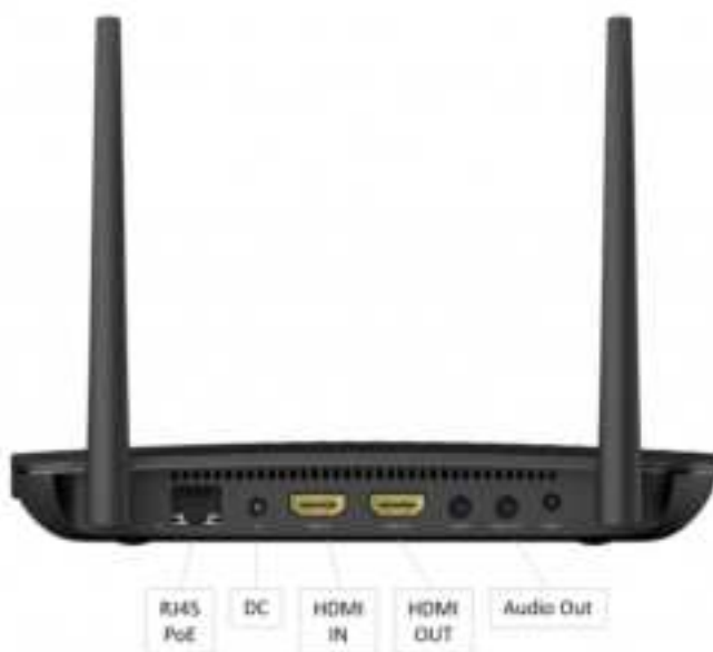
X900 Key Peripheral Ports