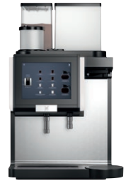
WMF 9000 F (Internal Storage)