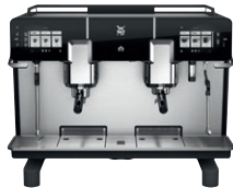
WMF espresso NEXT

Fully automatic coffee specialties machines