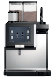
WMF 9000 F (External Storage)