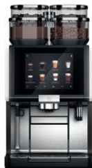
WMF 9000 S+